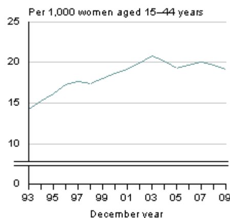
General abortion rate 1993–2009